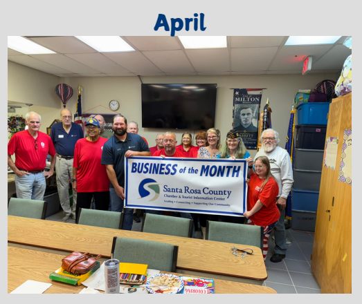
American Legion, Post #78