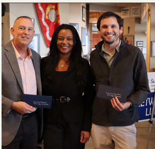
THANK YOU, BLACKWATER BAY TOURS FOR THE GIFT CERTIFICATES!