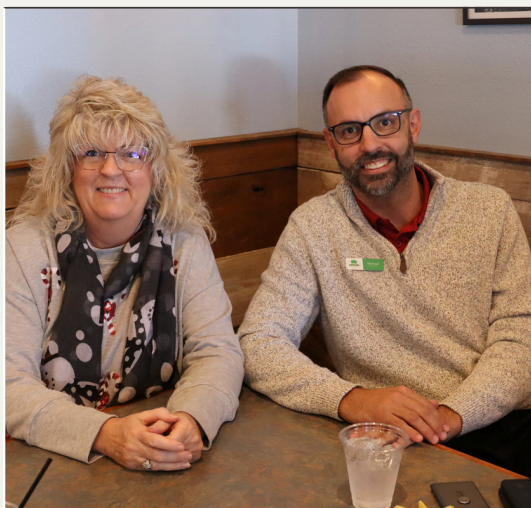
THANK YOU, HARVESTERS CREDIT UNION!