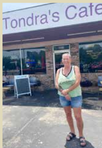
The May Ambassadors Lunch was held at Tondra's Cafe in Milton.