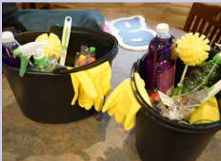
Thematic door prizes courtesy of Commercial Contract Cleaning & Pressure Washing. Thank you so much!